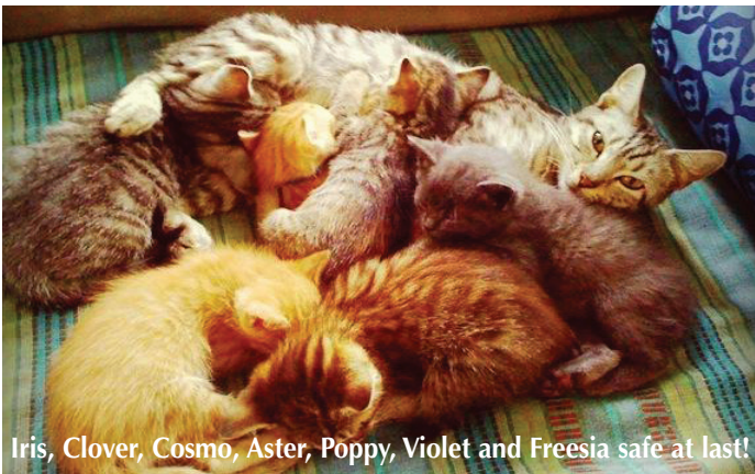
Iris, Clover, Cosmo, Aster, Poppy, Violet and Freesia safe at last!

Traffic had come to a stop on a road near Terre Haute. A kitten had been hit by a car and the little gray momma cat was standing guard with her two surviving babies. Animal Control had to physically remove the three then deliver them to the nearby Humane Society. There Iris continued to care for her two babies but soon her tiny family grew bigger. Four young orphans were found nearby and they desperately needed a momma. Iris accepted them immediately! She groomed them and began nursing as if they had been hers all along. Her two babies, Clover and Cosmo, seemed happy with the arrangement too, although there were a few adjustments to be made at mealtime. This lovely little family is now safe in an AHS foster home and soon will be ready for adoption. Please sponsor Iris and her little "flowers" while they are with AHS so we can continue to rescue more wonderful families like this!