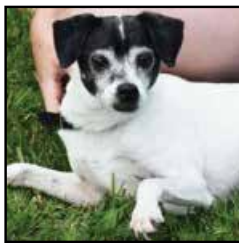
Percy Rat Terrier Mix 9 years old

Visit the adoptable dogs page of our website at www.animalhouseshelter.com and click on their pictures for more information. Adoption applications and foster applications can be found on the online application page and click on any "donate now" button to sponsor!