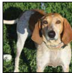
Penny Red Tick Coonhound/pointer mix 7 and 1/2 years old