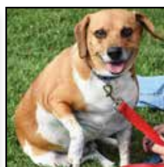
Danny Beagle Mix 2 years