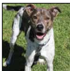
Rocky Shepherd/pointer 1 year