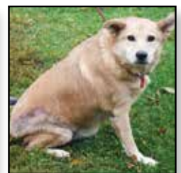
Sandy Lab/Shiba Inu Mix 8 years old