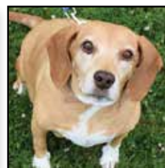
Sadie Beagle Mix 10 years old