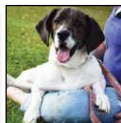
Sonic Basset Hound mix 4 years