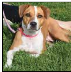
Halo Lab beagle mix 3 years old