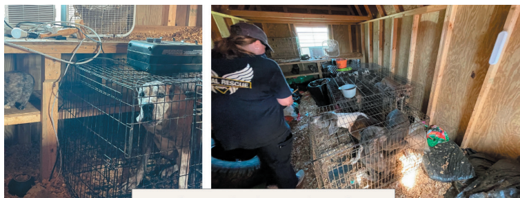
Operation Gentle Giants

Our partner, Animal Rescue Corps, rescued 30+ animals from a backyard breeding operation. The animals consisted of Great Danes and other large breed dogs, 5 cats, and 2 chinchillas. Many dogs inside the indoor spaces were packed in small cages, unable to stand, turn around, or spread their limbs freely. The animals were used and bred for profit with absolutely no regard for their needs. These animals suffered from numerous health conditions, including cherry eye, mammary tumors, granulomas on paws/legs from pressure sores, and several other conditions caused by unsanitary living and neglect. Many of these animals were terrified to even leave their cages. Animal House took in several of these animals. Please donate so we can continue to help neglected animals like them.